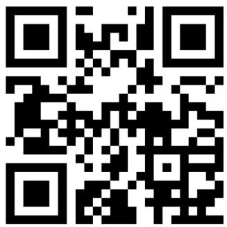
Post 57 Webpage